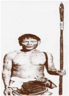
The International Alliance for Indigenous and Tribal Peoples of the Tropical Forest