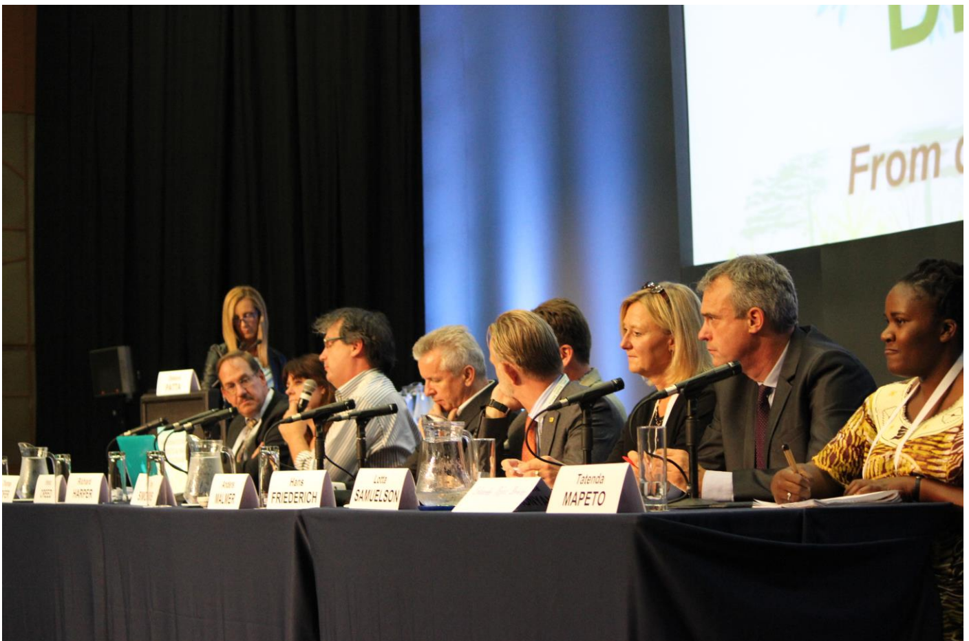
Debora Patta, CBS News Africa Correspondent, moderates the review panel discussion on the key messages of the International Forests and Water Dialogue and the next steps for the Forests and Water Agenda.