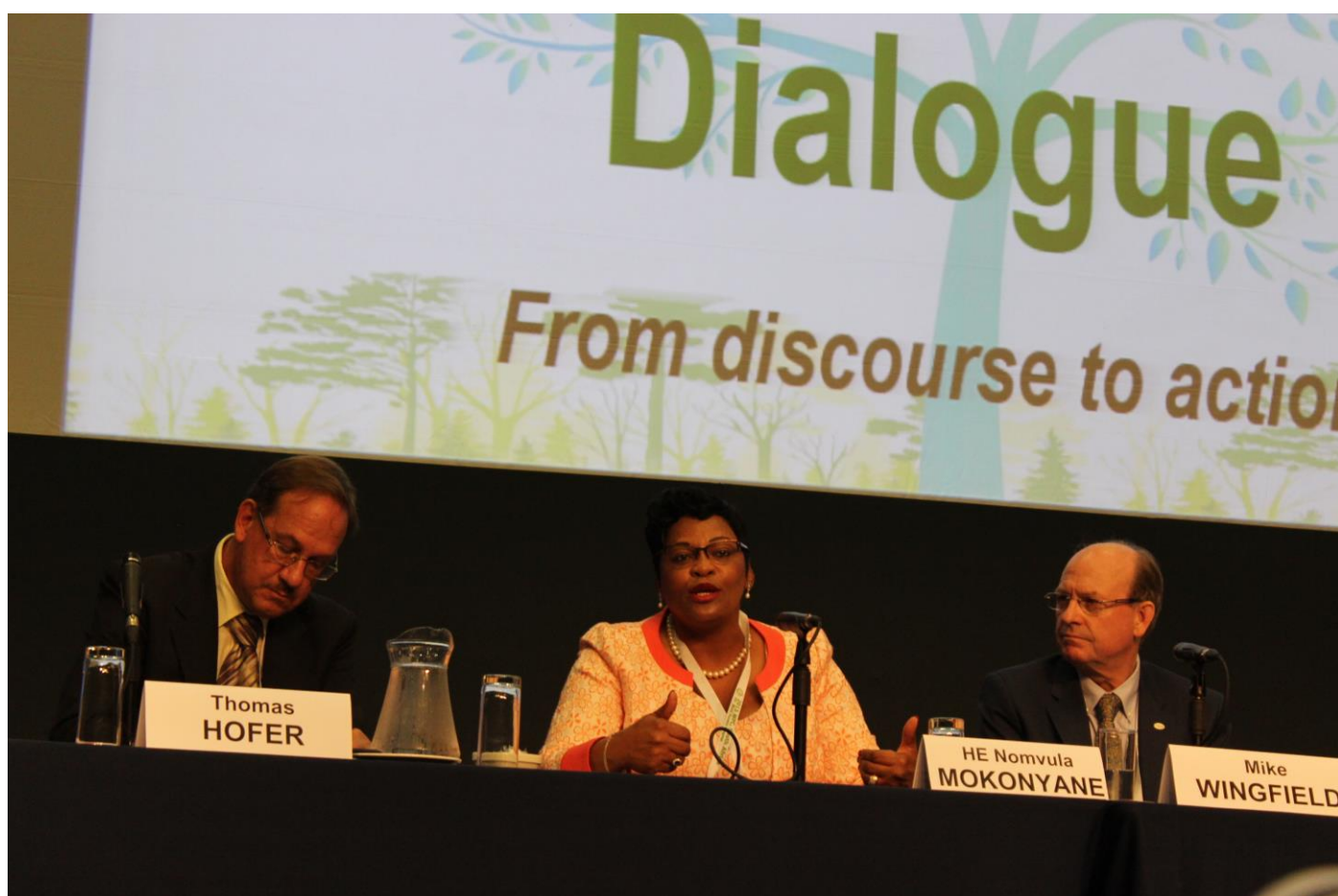
HE Nomvula Mokonyane, Minister of Water and Sanitation, South Africa – also known as “Mama Action” – opens the International Forests and Water Dialogue with a keynote speech on the importance of forest-water interactions in South Africa.

Mike Wingfield, President of IUFRO, described the many forest functions related to water from a scientific perspective and placing forests in a landscape context, while recognizing that knowledge gaps on many aspects of these interactions exist. He addressed the importance of ensuring the availability and sustainable management of water and sanitation for all people, which is one of the new Sustainable Development Goals (SDGs).