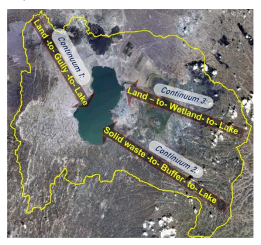
Figure 2 Typical source-to-lake continuum charaterising sediment flow into Lake Hawassa

Whilst the sources of sediments are widespread, Belete (2019) noted three key continuums in terms of sediment flows into Lake Hawassa: Continuum 1: Source-Gully-Lake, Continuum 2: Source-Urban Lake, and Continuum 3: Source-Lake Cheleleka-Lake Hawassa.