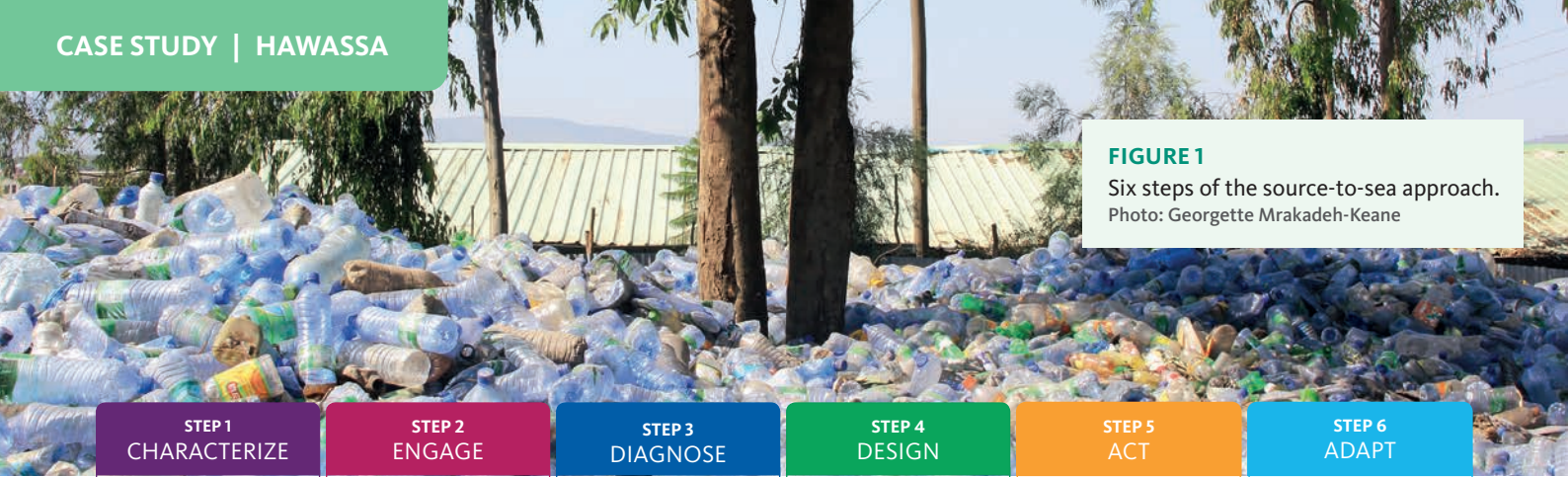
FIGURE 1 Six steps of the source-to-sea approach.