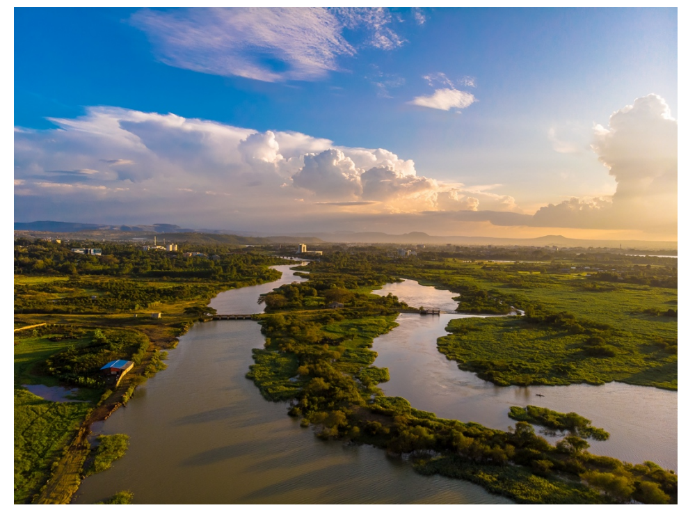
The Blue Nile at Bahir Dar, Ethiopia.

Latin America and Caribbean Centro Empresarial Arrecife Oficina 805, Torre 1 Bogotá, Colombia