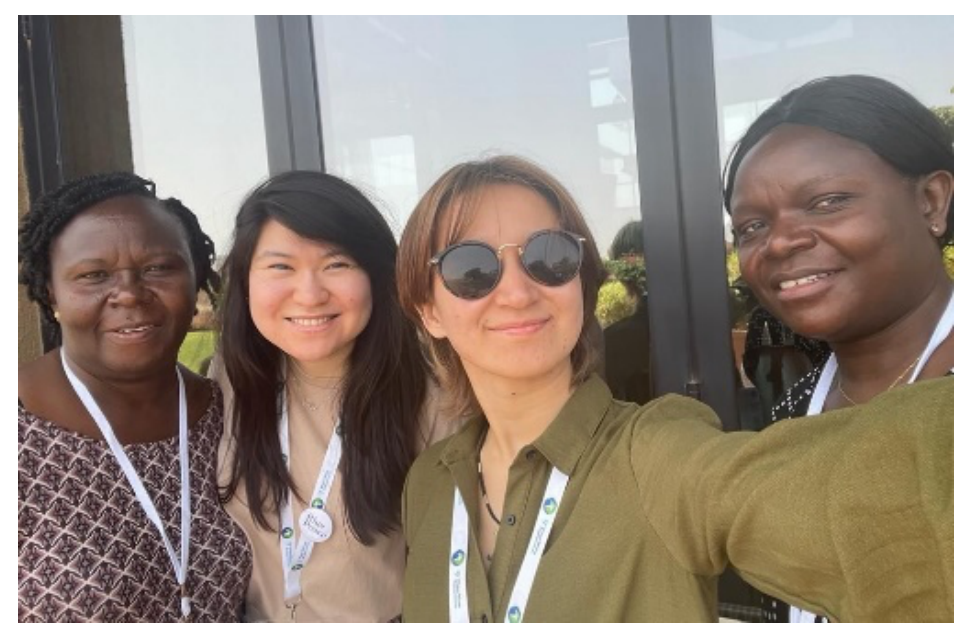
Network Members from the Nile and Central Asia meet socially at the World Water Forum, 2022.

Through recurrent process monitoring, Network participants have voiced their interest in further engaging through the Network, linking the Network to other related initiatives in Africa and globally, continuing network capacity development opportunities, and enhancing inter-basin learning, national coordination, and intergenerational knowledge exchange. Participants have demonstrated that their ongoing engagement in the Women in Water Diplomacy Network is relevant and applicable to their professional work; nearly all indicated that they use knowledge gained from their participation in Network activities, with more than half indicating that they use the information 'regularly .' Moreover, a near complete plurality of respondents have indicated that the Women in Water Diplomacy Network contributes to improved transboundary water cooperation at the country, sub-basin, and basin levels.