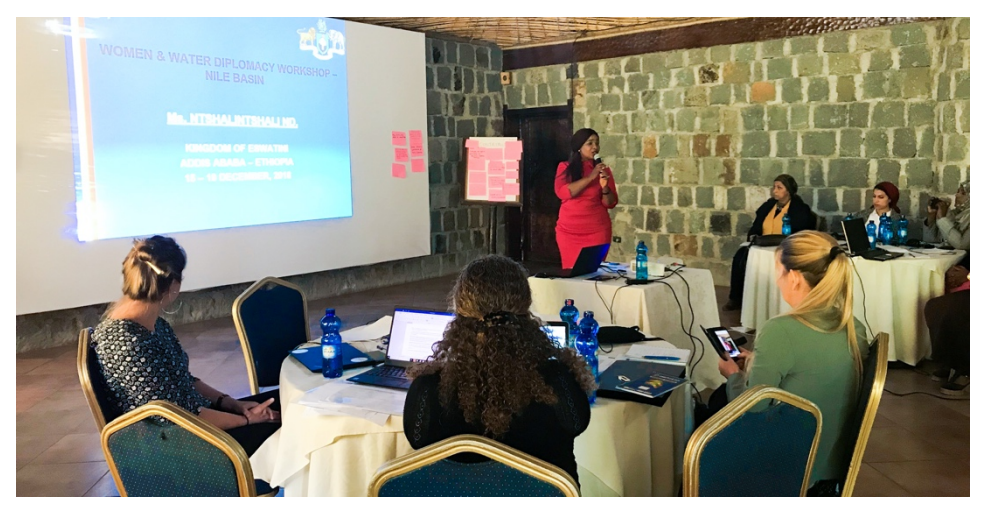
Women in Water Diplomacy workshop, Addis Ababa, Ethopia.