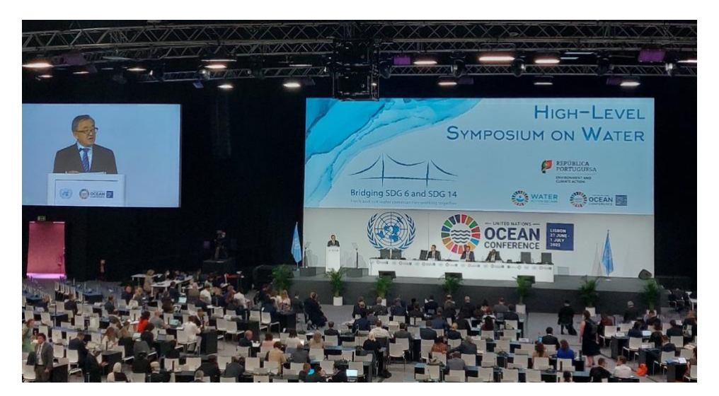
Image 1. Liu Zhenmin, Under-Secretary-General of the United Nations, calls for a S2S vision of the full water cycle to achieve the 2030 Agenda in his opening remarks for the High-Level Symposium on Water at the United Nations Ocean Conference.

The work plan was designed to make maximal use of the limited resources available to the Platform Secretariat through strategic selection of activities and active engagement of the S2S Platform partners. Covid-19 pandemic regulations were eased in many countries in 2022. This made it possible to organize in-person events and attend conferences physically. It also meant that several conferences that had been postponed in the last couple of years due to the pandemic took place in 2022, making it a very busy calendar of events. The S2S Platform and its partners took advantage of this opportunity to drive forward momentum for S2S management in the lead-up to the 2023 United Nations Water Conference.