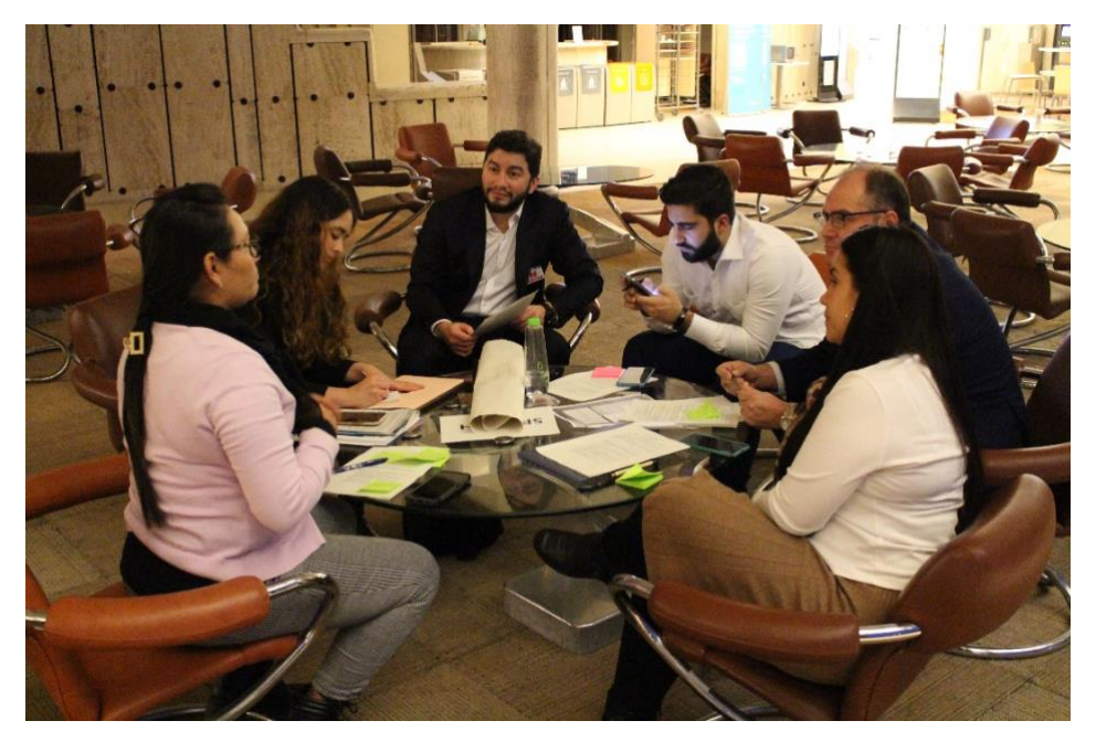
Image 10: Break-out group session at the UNECE workshop.

Partners and supporters have shared more than 15 S2S actions on the ground that are still active or have concluded recently. These activities, collected in Annex 2, are evidence that momentum for S2S management transcends international processes and is also reflected on the ground. The actions of partners and supporters can provide very valuable knowledge about how the uptake of S2S management can be advanced and lessons learned from the field that can improve future activities.