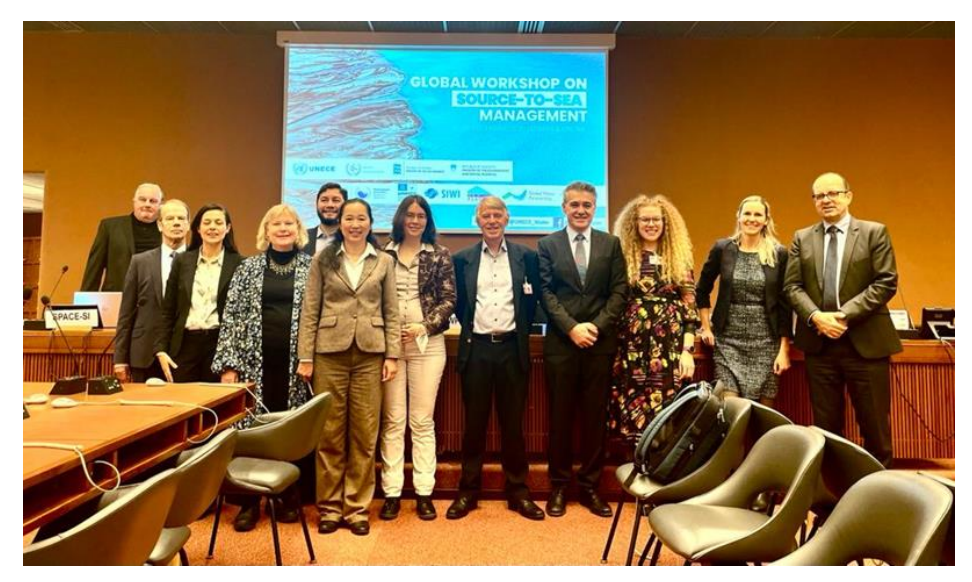
Image 8. Part of the organizing team of the UNECE workshop.

The workshop gathered experts and policy-makers from the freshwater and ocean communities, as well as from transboundary basin organizations and marine organizations, with the aim of strengthening cooperation and sharing good practices in policy-making and implementation of effective S2S management. The workshop was held both in person at Conference Room XXI, Palais Des Nations and online. Three hundred participants registered for the workshop. Although UNECE was the core organizer of the workshop, it relied heavily on the S2S Platform and its partners to provide S2S expertise. Panel discussions and practical group work provided opportunities for participants to learn how the S2S approach could be useful in their transboundary basins.