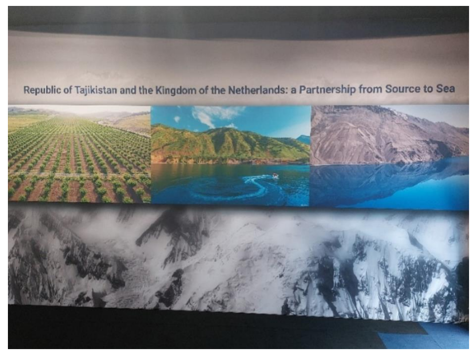
Image 7. Billboard promoting the partnership between the Netherlands and Tajikistan for the United Nations Water Conference titled "from Source to Sea".

In the case of Henk Ovink and Peter Thomson, both have continued to promote S2S management and the Platform in engagements not organized by the Secretariat. This is evidence of their support for the S2S "ethos" and that they have both internalized our message. For example, the Netherlands and Tajikistan have titled their partnership as co-hosts of the 2023 United Nations Water Conference "from Source to Sea".